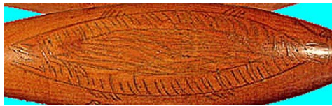
The Country Bobbin Fish.

For an example of the fish we need to look at the maritime decoration of East Devon bobbins, as fish appear on them quite frequently, but less frequently in the form on the Country bobbin.