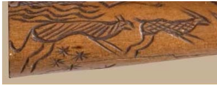
T.7-1944 Lace Bobbin Wood, carved with figures (detail) English, c.1795

The Country Bobbin animal is at rest, the Shepherds bobbin animals are very dynamic and seem to be in full chase.