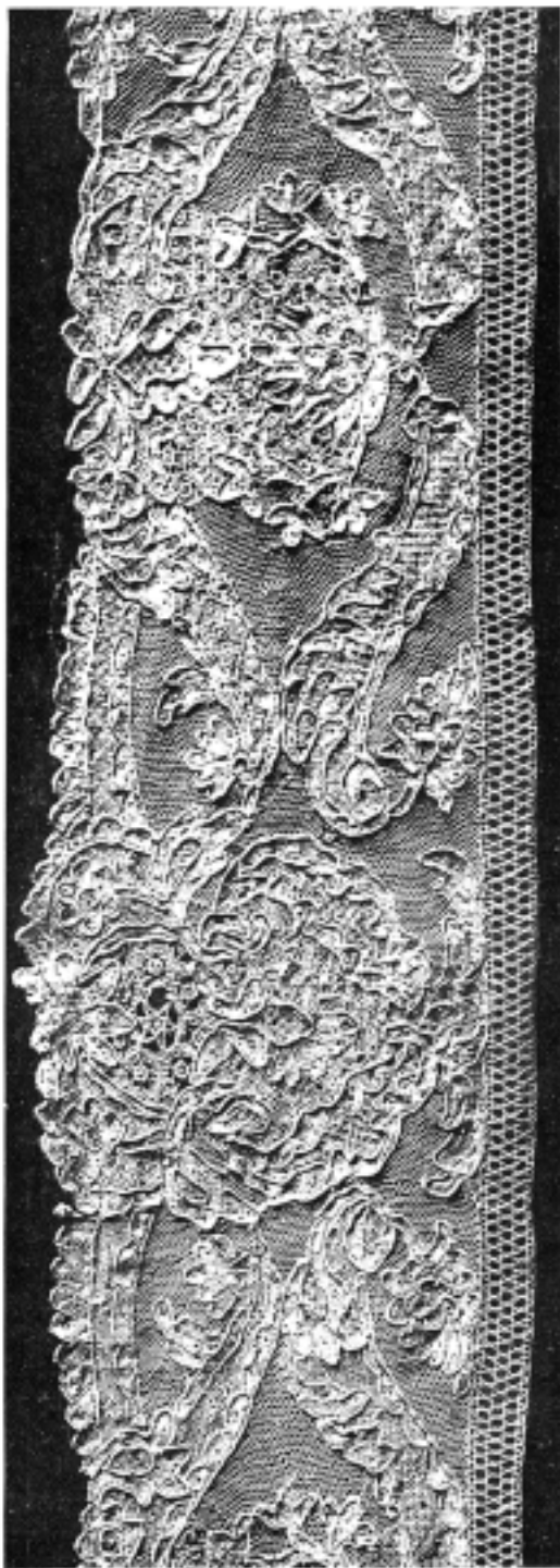
POINT D'ALENÇON BORDER PERIOD, LOUIS XV. (EARLY)

Point d'Argentan has been thought to be especially distinguished by its hexagonally arranged brides , but this has also been noticed as a peculiarity of certain Venetian point laces. The Argentan bride -ground is a large six-sided mesh, worked over with the point noué , or button-hole stitch. Each side of