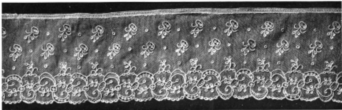
ALENÇON PERIOD, LOUIS XVI. (WIDTH, 3\frac{1}{2} INCHES)